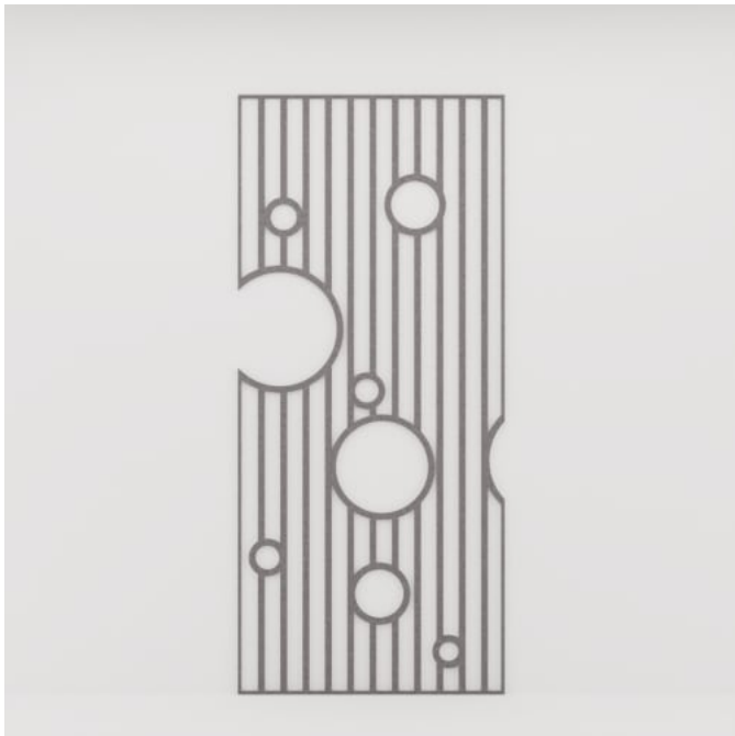
Pattern Panel Krishnan Detail