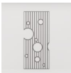
Pattern Panel Krishnan Detail