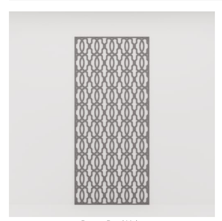
Pattern Panel Links