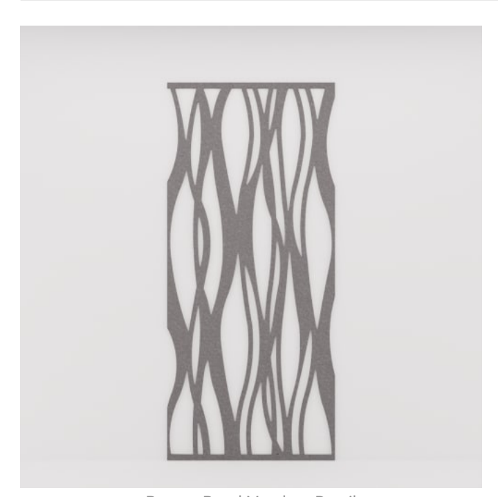
Pattern Panel Mandava Detail