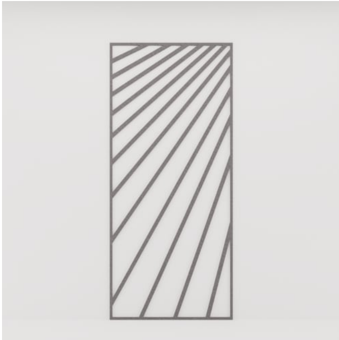
Pattern Panel Nadu Detail