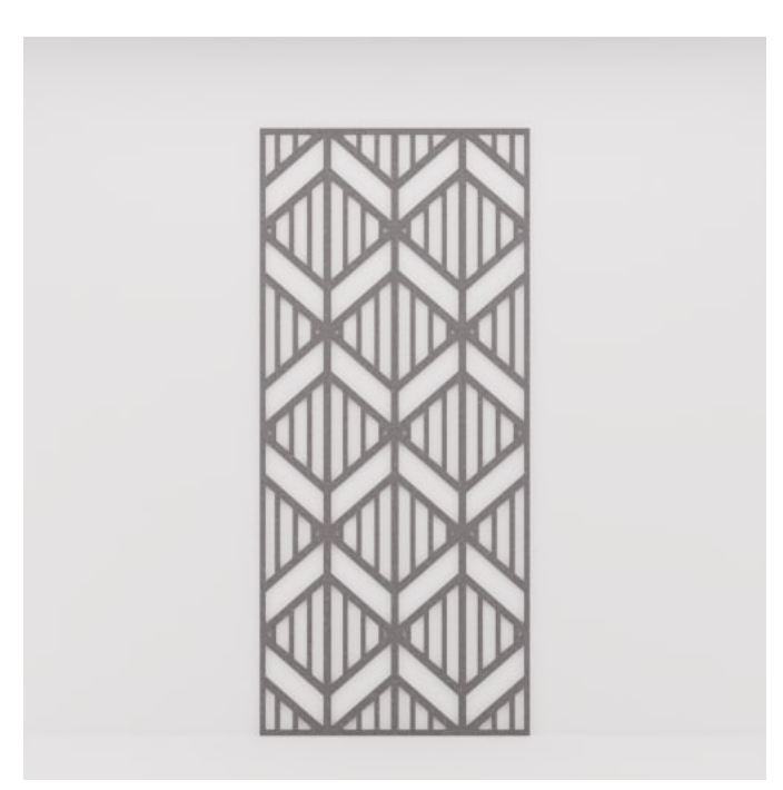
Pattern Panel Pivot Detail