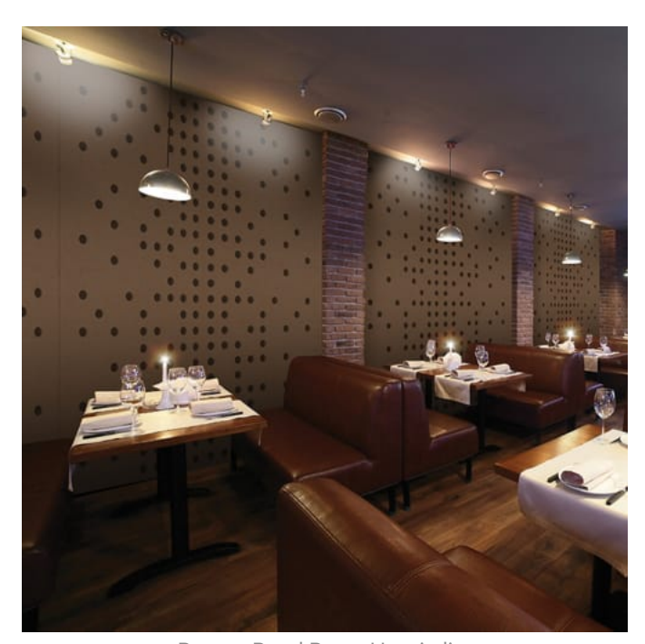
Pattern Panel Punto Hospitality