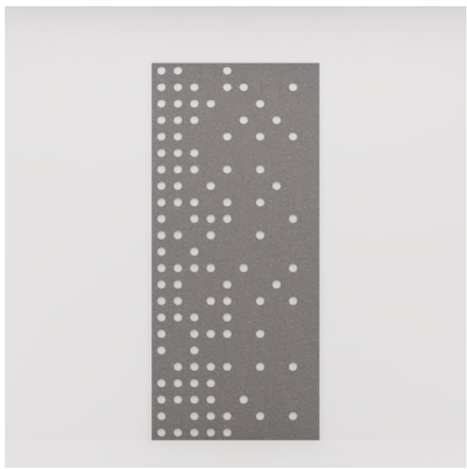
Pattern Panel Punto Detail