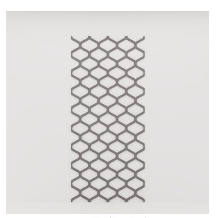
Pattern Panel Raja Detail