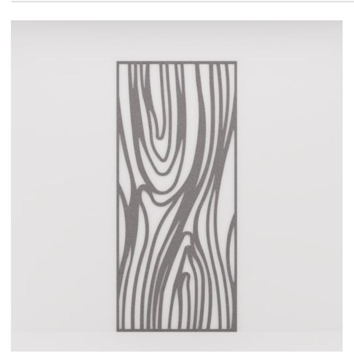
Pattern Panel Sankaran Detail