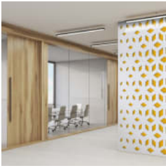
Pattern Panel Shard Frost on Sunshine