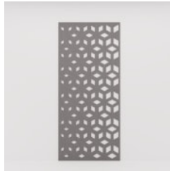
Pattern Panel Shard Detail