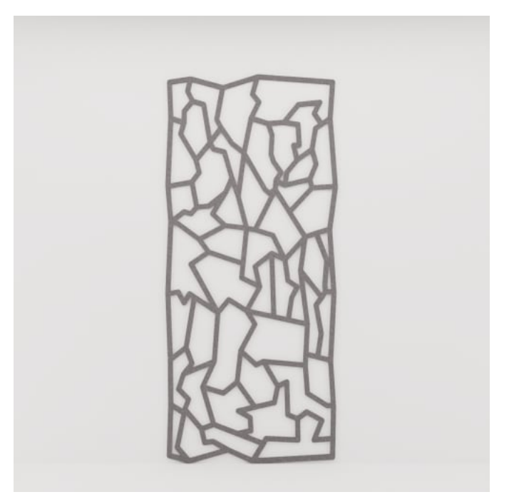
Pattern Panel Siptical B Detail