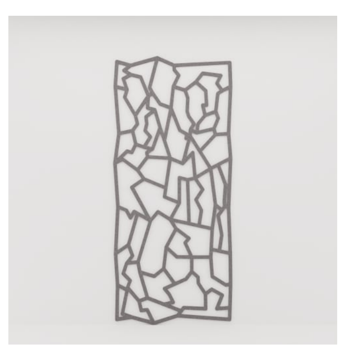
Pattern Panel Siptical A Detail