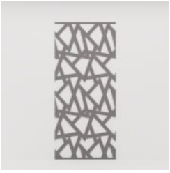
Pattern Panel Telugu Detail