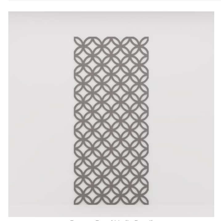
Pattern Panel Vedic Detail