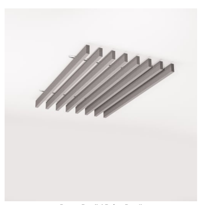
Beams Parallel Rafter Detail