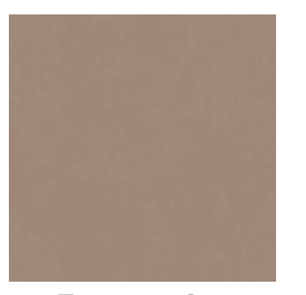
Terracotta Sun Bleached