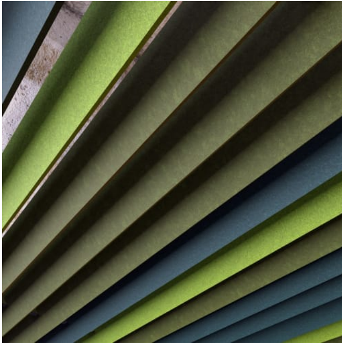
Baffle Systems Louvre Detail