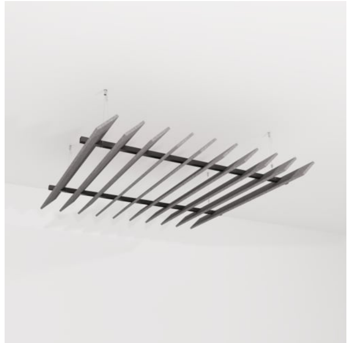
Baffle Systems Louvre Detail