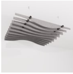
Baffle Systems Swell Detail