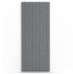
Emboss Panel Ascend Detail