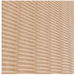
Emboss Panel Ascend Detail Ecu