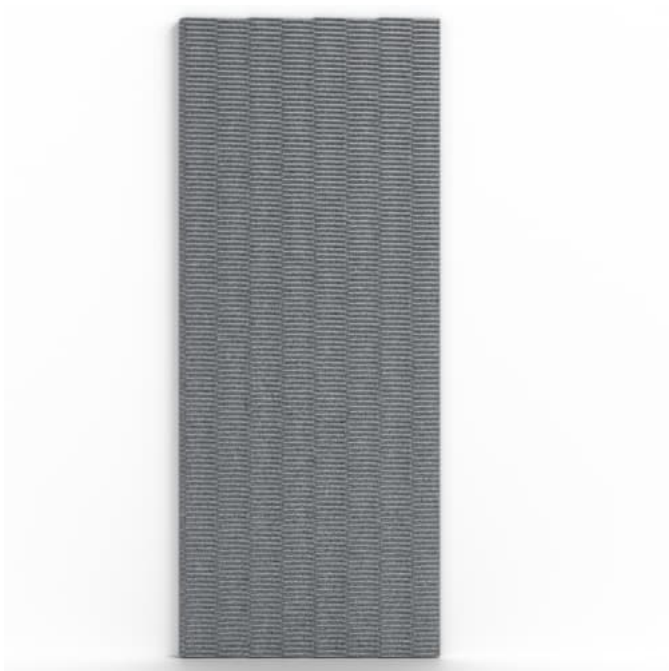
Emboss Panel Ascend Detail