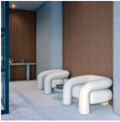
Emboss Panel Ascend Saffron