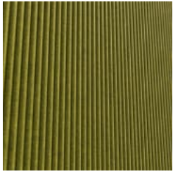
Emboss Panel Corduroy Fine Detail Olive