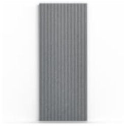
Emboss Panel Corduroy Fine Detail