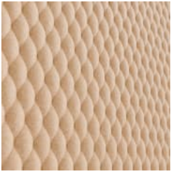
Emboss Panel Detail Ecu