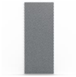
Emboss Panel Detail