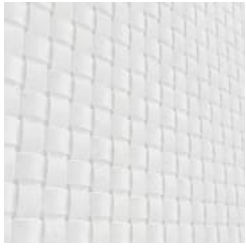
Emboss Panel Woven Detail Parchment