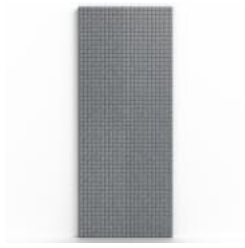
Emboss Panel Woven Detail