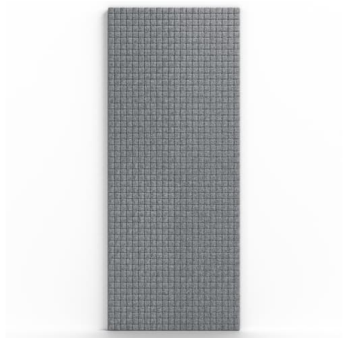
Emboss Panel Woven Detail