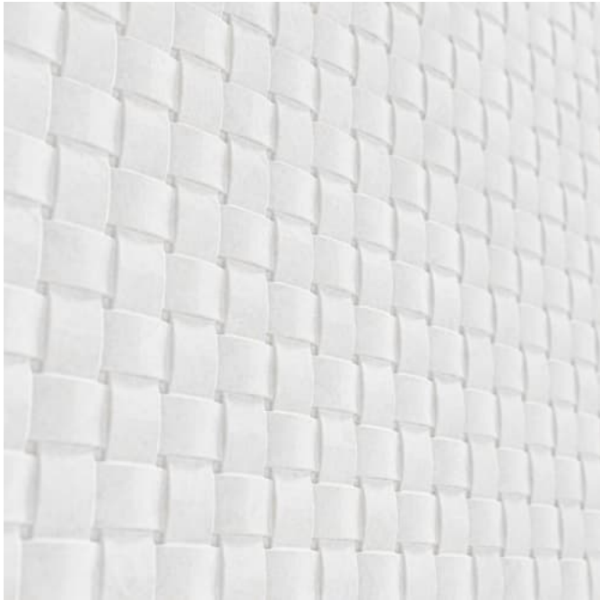
Emboss Panel Woven Detail Parchment