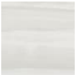
AZ53824 PEARL GREY