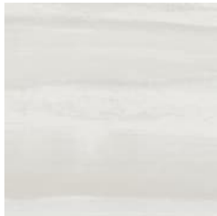
AZ53824 PEARL GREY