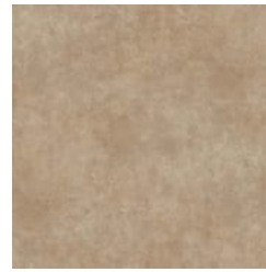
AVF27-128 SAND DUNE