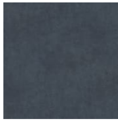
AVF27-333 SARGASSO SEA