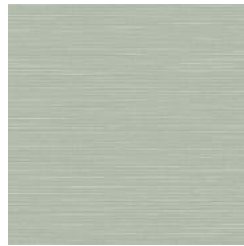
AZ53846 MEADOW SAGE