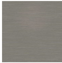
AZ53831 RIDGE GREY