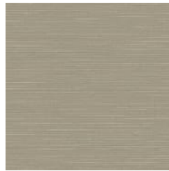
AZ53841 FAIRVIEW TAUPE