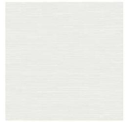
AZ53833 PEARL GREY