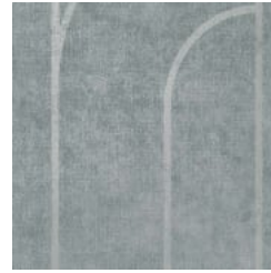
BB-VA-03 PACIFIC SILVER