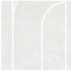
BB-VA-01 CURVED CHALK