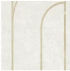
BB-VA-05 GOLDEN WHITE