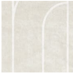
BB-VA-06 OPAL ARC