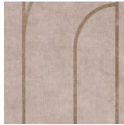
BB-VA-07 WILD ROSE