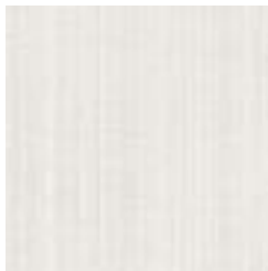
60451 LIGHT YEAR