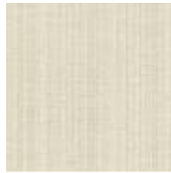
60448 WHITE SAND