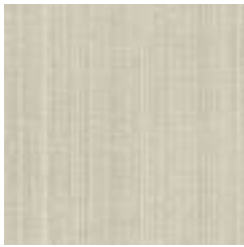
60445 PALE MOON