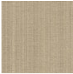
60446 TOP SOIL