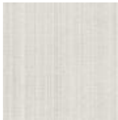
60452 CLEAR SKY