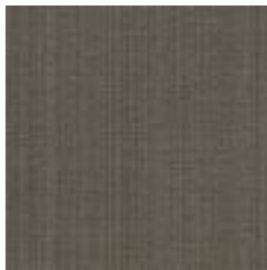
60456 BLACK HOLE