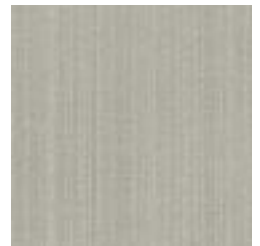
60454 GREY SHADOW