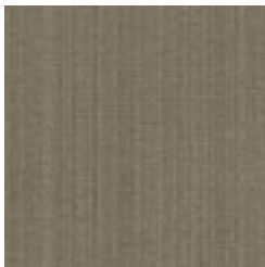
60455 NIGHT SKY