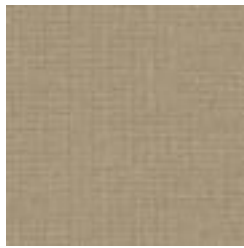
60478 CHIC CAMEL