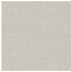
60466 POLISHED WHITE