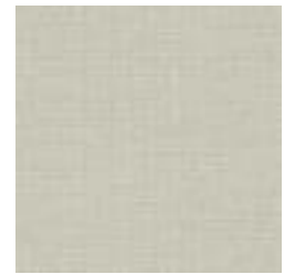
60475 FRENCH CUFFS