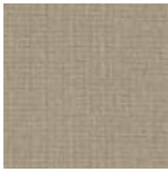
60477 WOVEN TAUPE