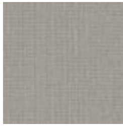
60468 GREY LOAFERS