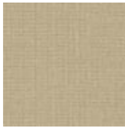
60473 TAILOR MADE