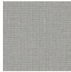
60467 COOL THREADS