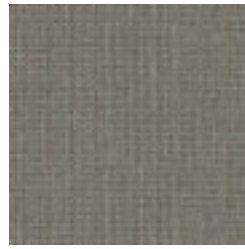
60469 BLACK TIE