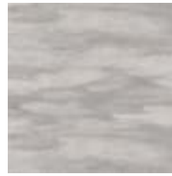
SP81-07 MAJOR GREY