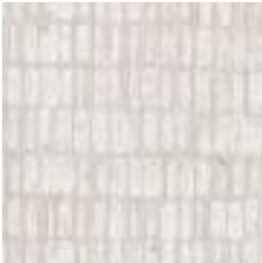
SK81-06 PAMPAS GRASS