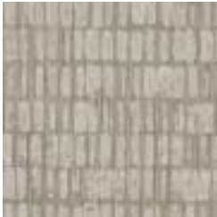
SK81-07 NO WASTE