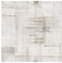
ABS02-024 AL FRESCO