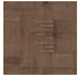
ABS02-497 VINTAGE TOUCH