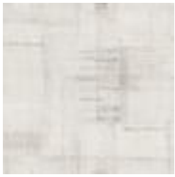
ABS02-006 DAPPLED LIGHT