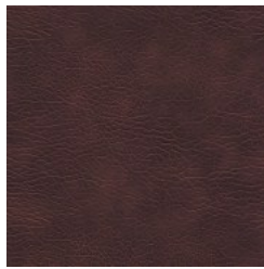
1011247 RED ROCK